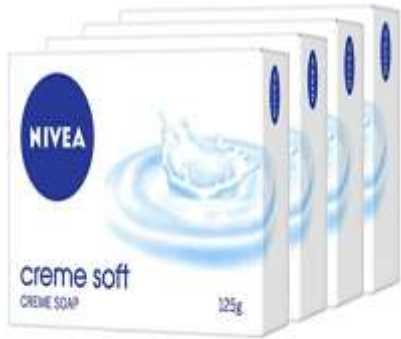
1. Main Image – front shot