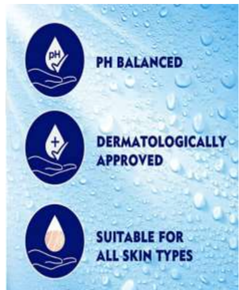
4. Key Benefits/ Features