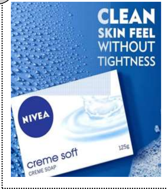
5. Lifestyle (optional)