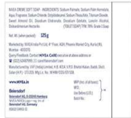
2. Back of the bottle