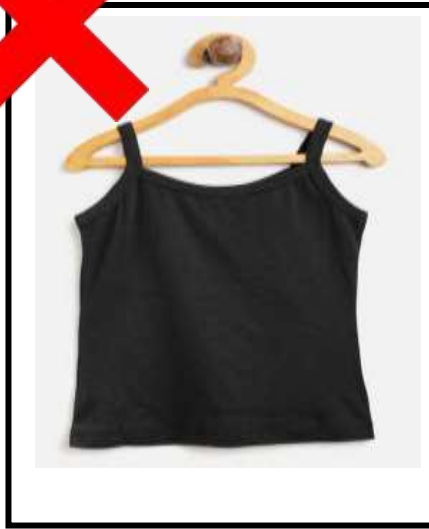
Products on hanger are not allowed.