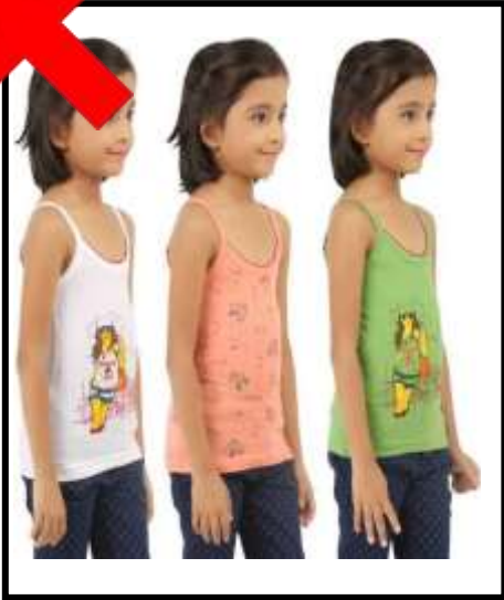
Model shots are not allowed.