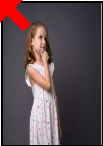
Grey backgrounds are not allowed.