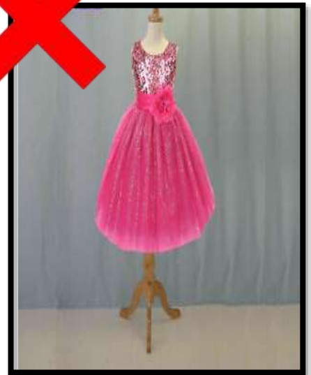
Products on mannequin are not allowed.