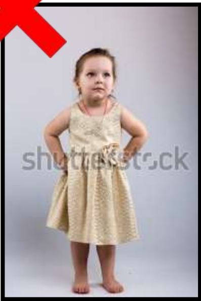
Watermark or text on products are not allowed.