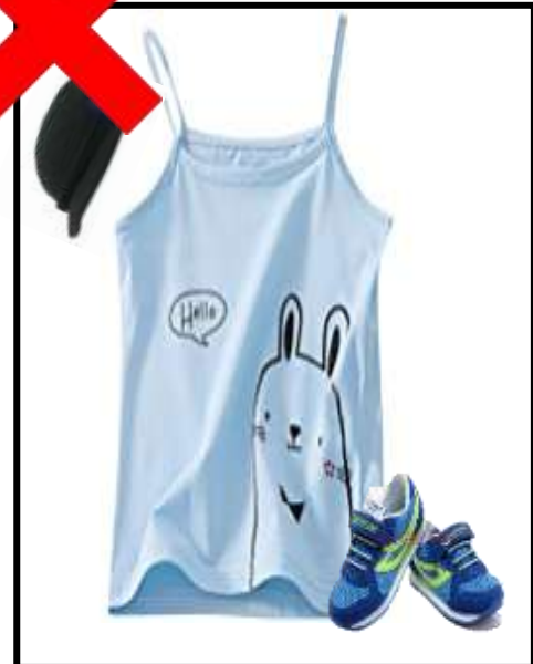
Accessories are not allowed in the image unless all the items in the image are sold as a bundle