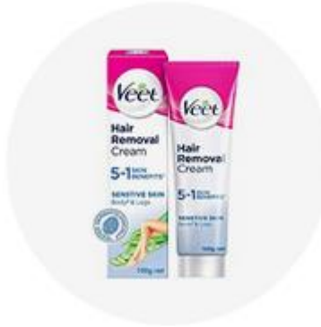
Hair Removal Creams