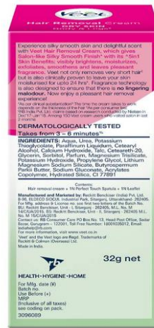
Second Image- Back View