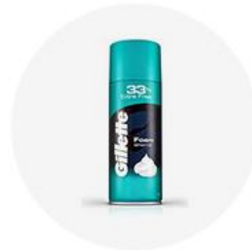
Shaving Foams & Creams