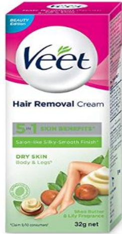
Main Image- Front View