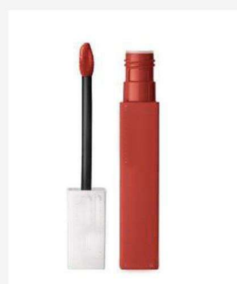
1. Main Image- Front Shot