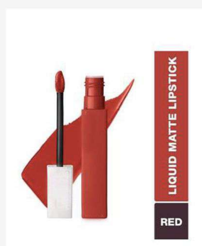
2. Swatch with Texture