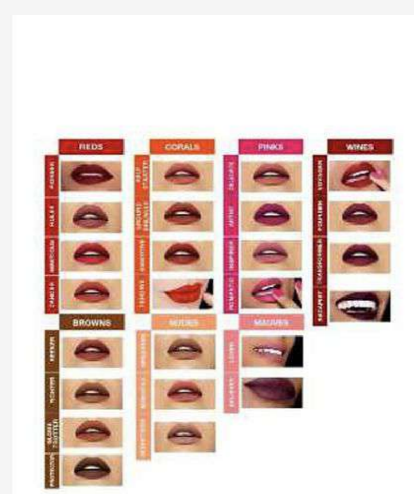
5. Other Shades in the Range