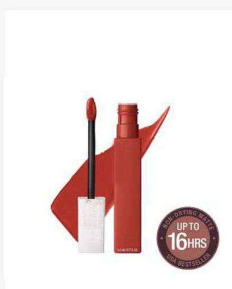
3. Key Benefits/Features