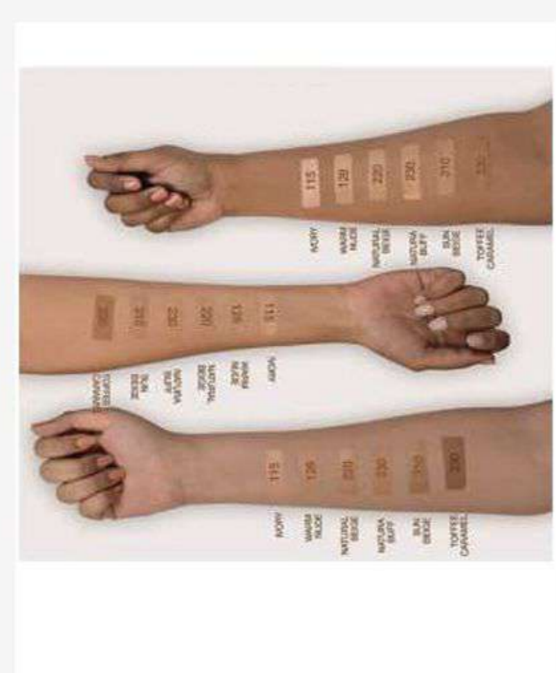
5 . Other shades in the range