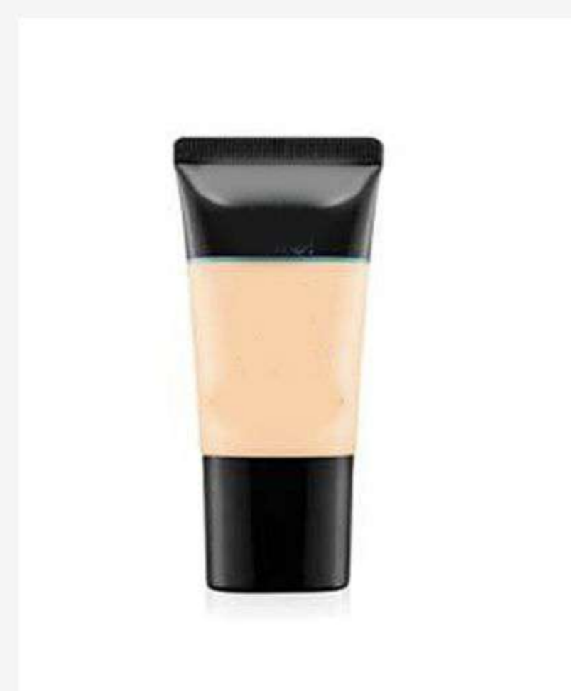
1. Main Image- Front Shot