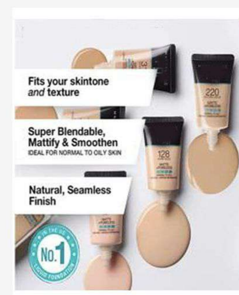
3 . Key Benefits / Features