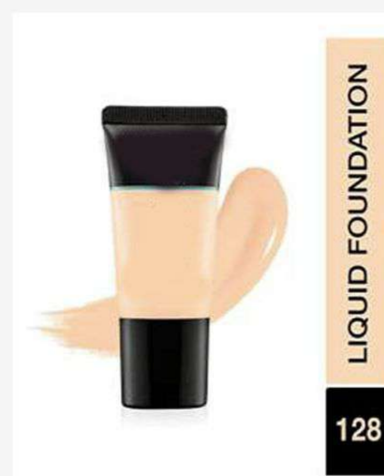
2 . Swatch with Texture