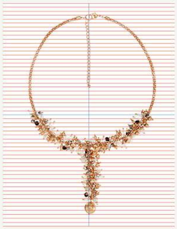
IMAGE 1 Give the necklace breathing space from side to side as well as top and bottom, show front