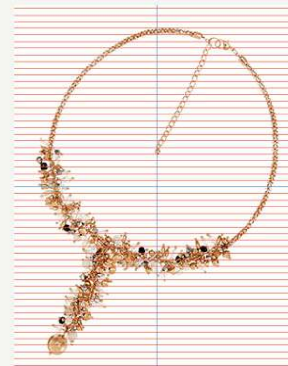
IMAGE 4 Zoom in to show details of the product