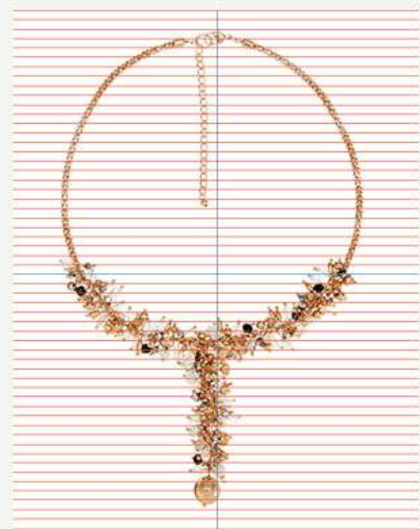
IMAGE 2 Maintaining the same alignment show back of the necklace