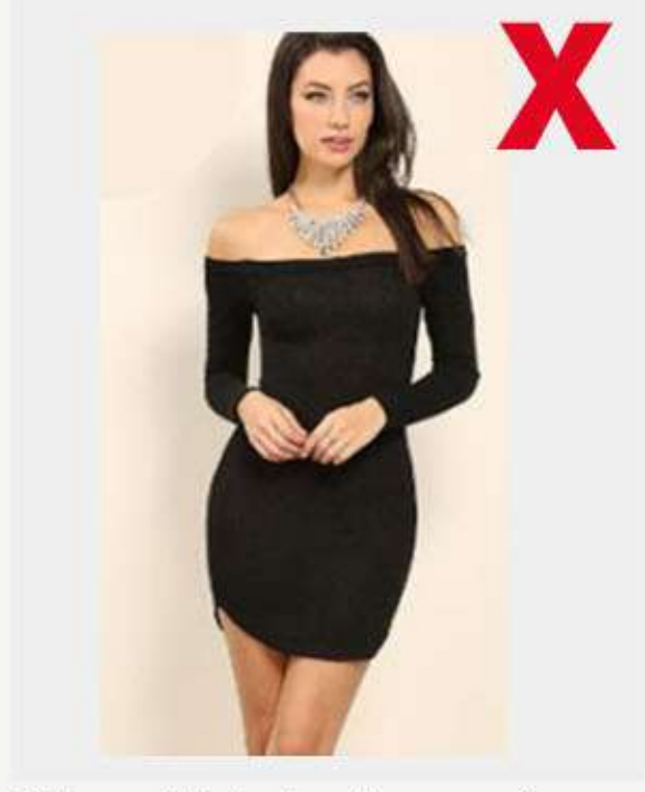
Full model shot; only crop of product along with the body part