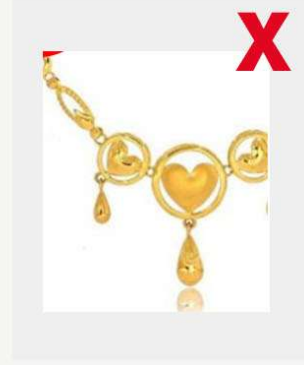
Half cut images