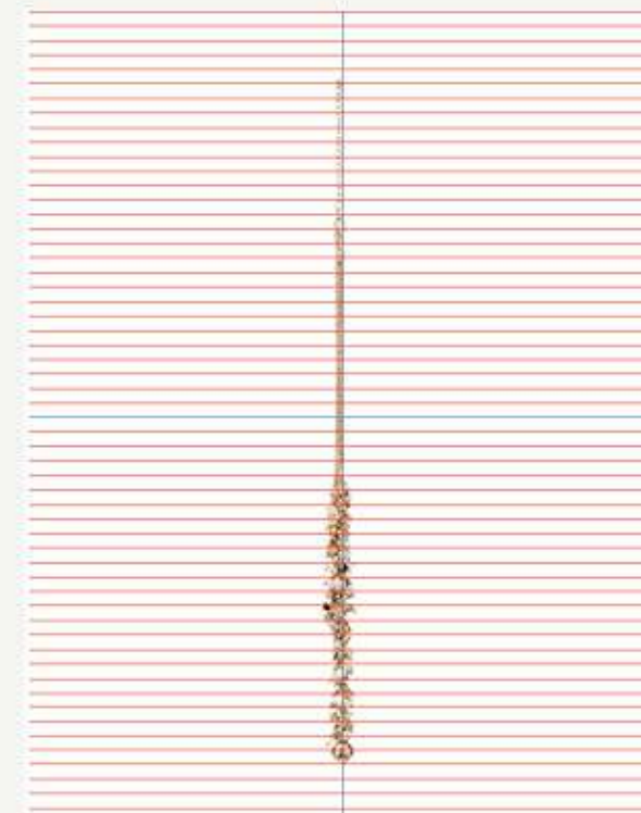
IMAGE 3 Keeping the product in the middle Show side of the product