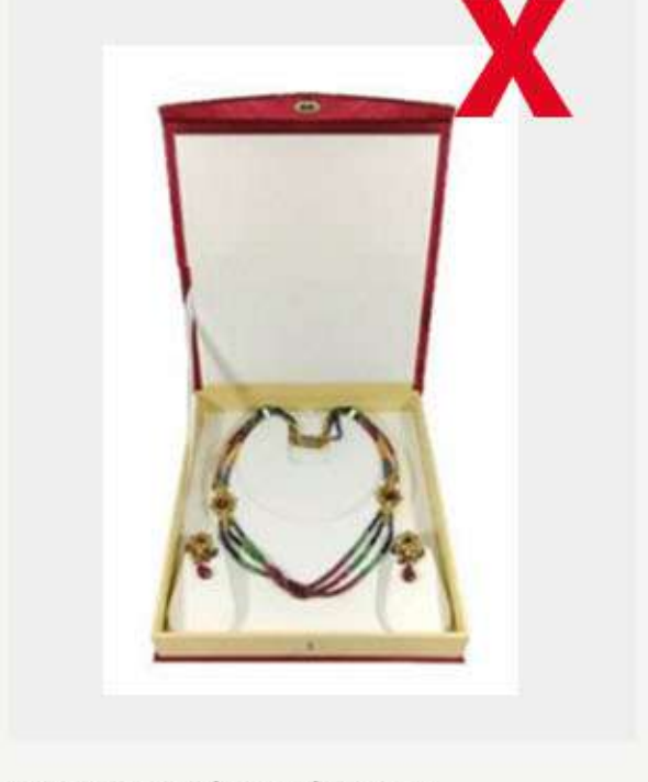
Images with packaging