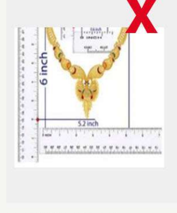
No additional allowed