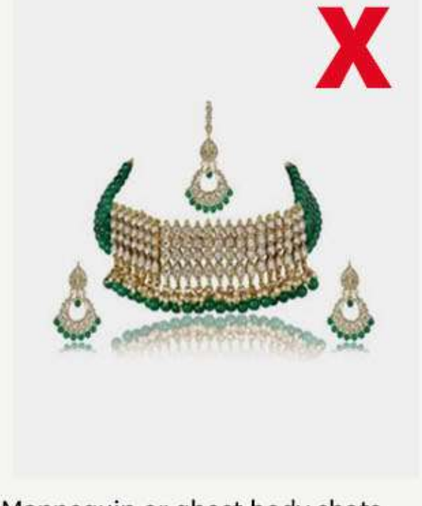
Mannequin or ghost body shots