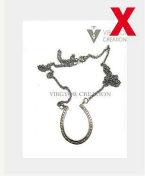
Images with watermark or text