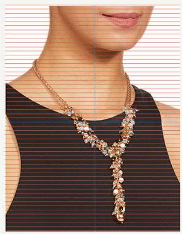
IMAGE 5 Show scale of the product on a model

A. Title Guidelines: Your product title is the first thing customers see when visiting your detail page and is vital in helping customers to find your products when they search online or visit Amazon.in. Titles also give important information to browsing customers, increasing the chances that they will click on and purchase one of your items. Amazon uses the words in product titles to display your products in search results. A concise and relevant title will drive traffic to your product. Always check titles for consistent format and accuracy. Follow the guidelines below to create product titles that make a good first impression.