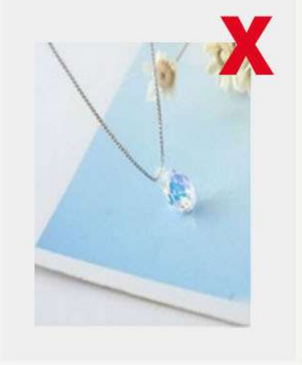
Images with props or accessories