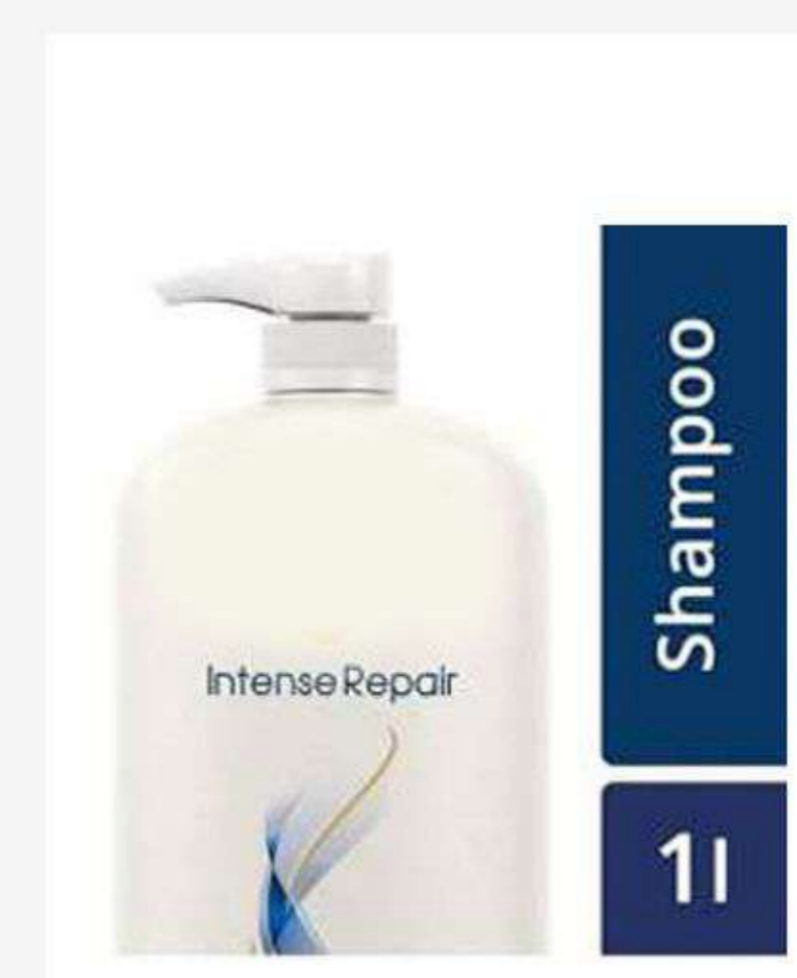
3 . Size of the bottle