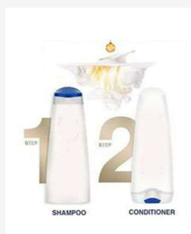
5 . Regime