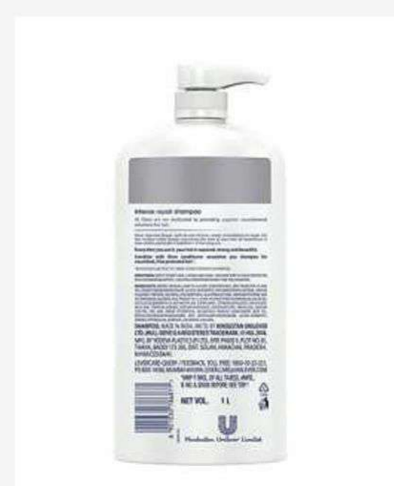
2 . Back of the bottle