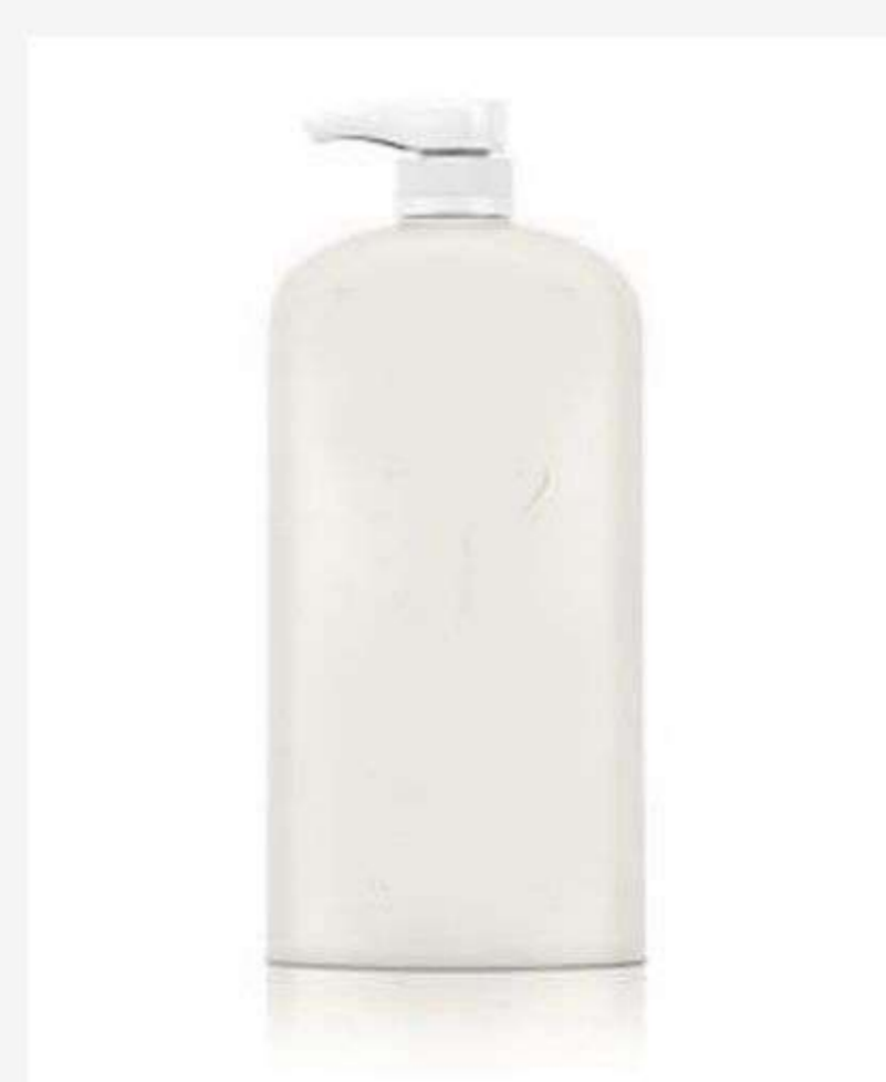
1. Main Image- Front Shot