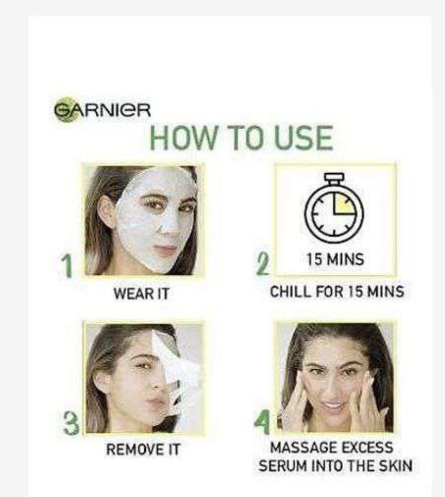
4 . Before and after