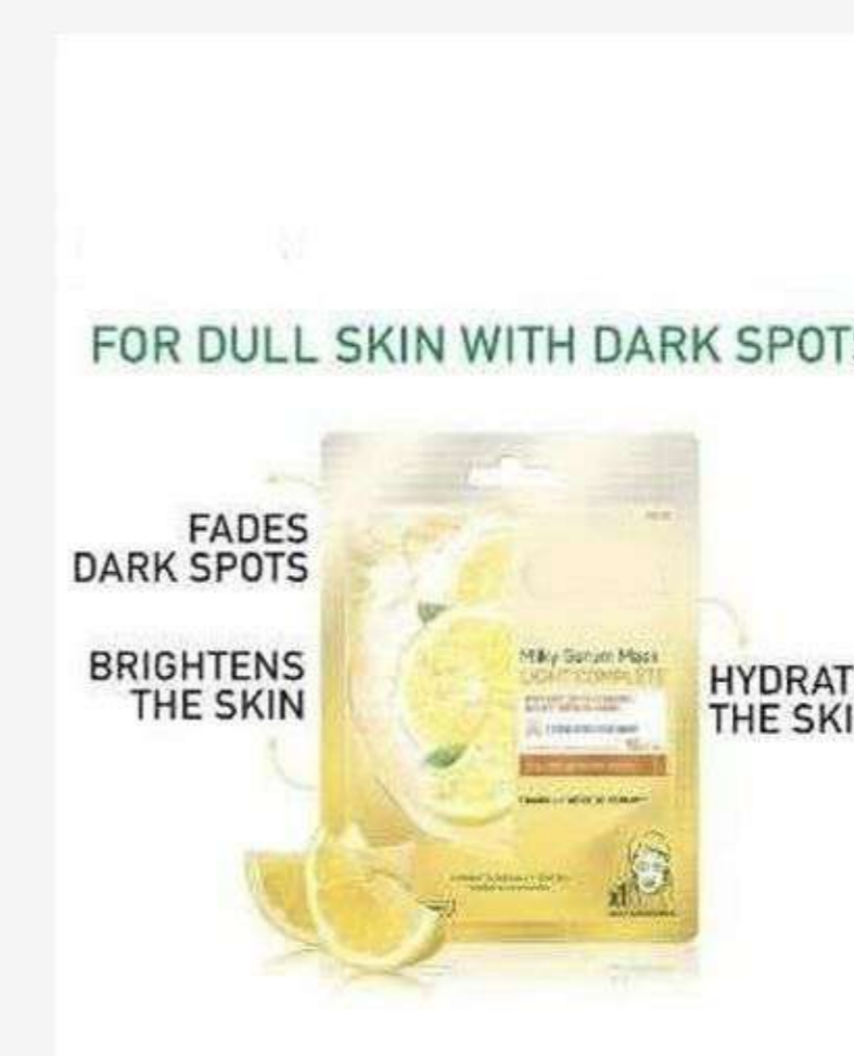
3 . Key Benefits / Features