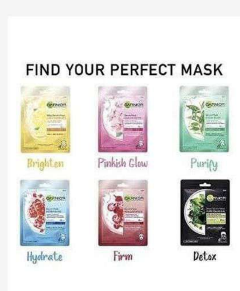
5 . Other shades in the range