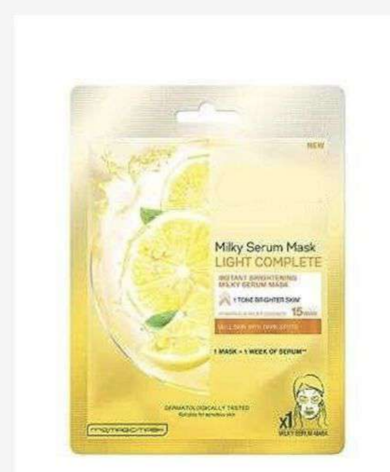
1. Main Image- Front Shot