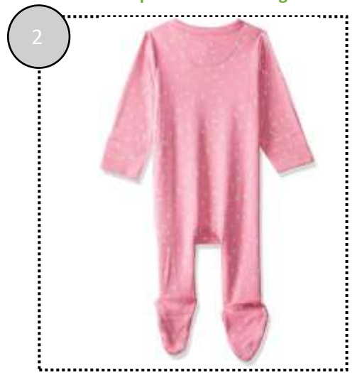
2. Girls sleepwear – Back Image