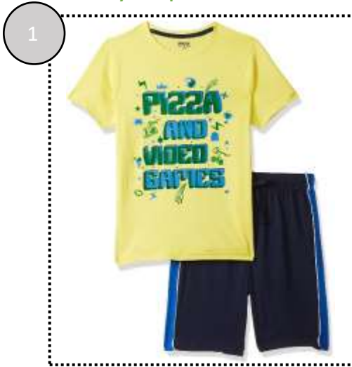
1. Boys sleepwear – Main