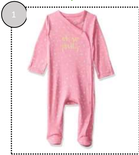
3. Girls Sleepwear – Main