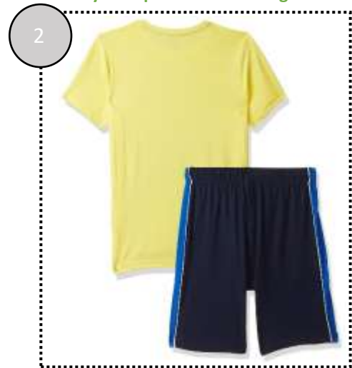
2. Boys sleepwear– Back Image