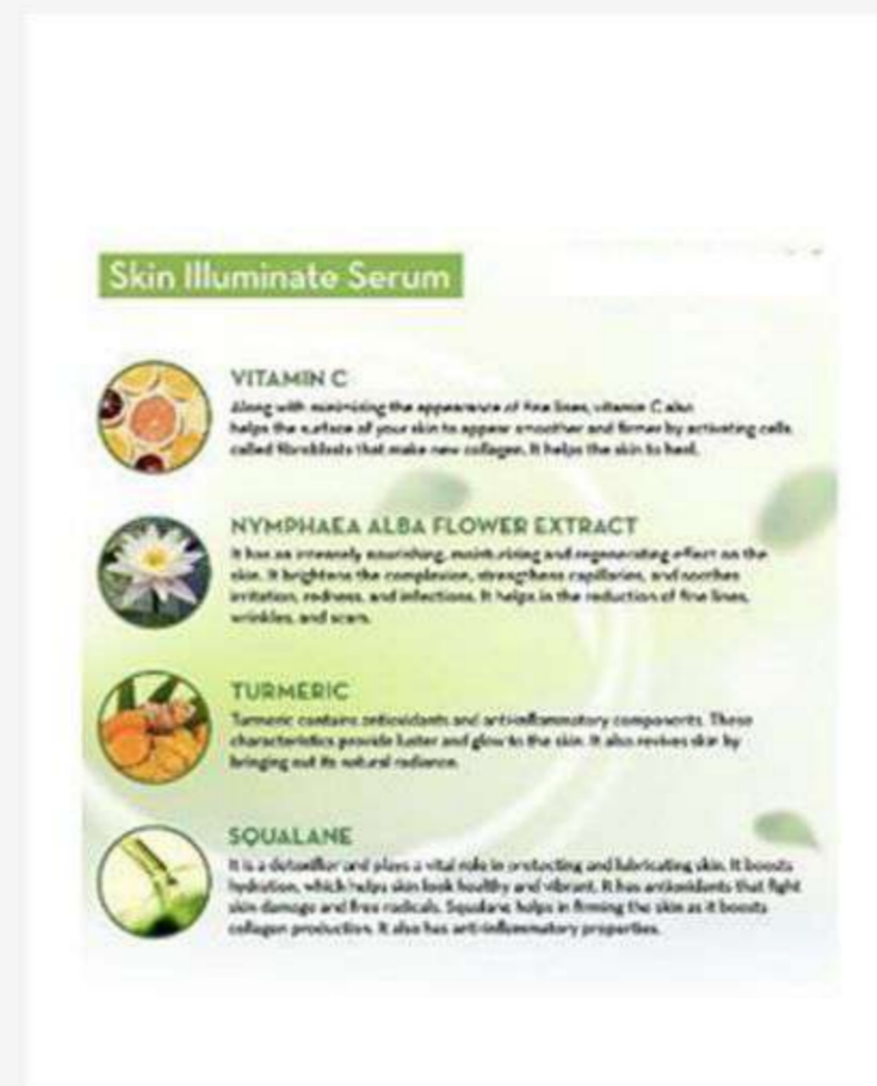
2 . Second Image Product Features