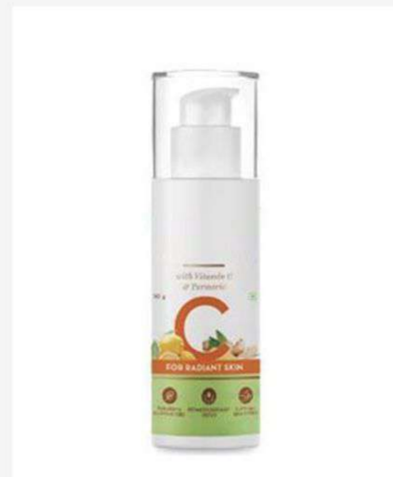
1. Main Image- Front Shot