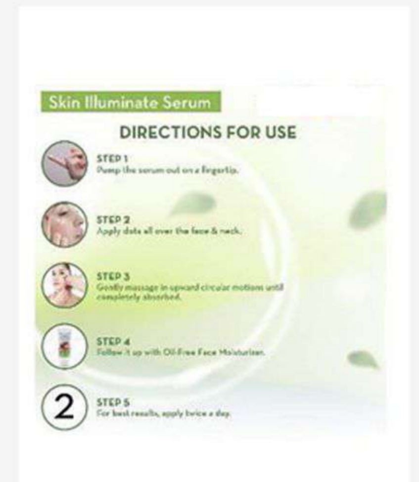
4 . How to apply