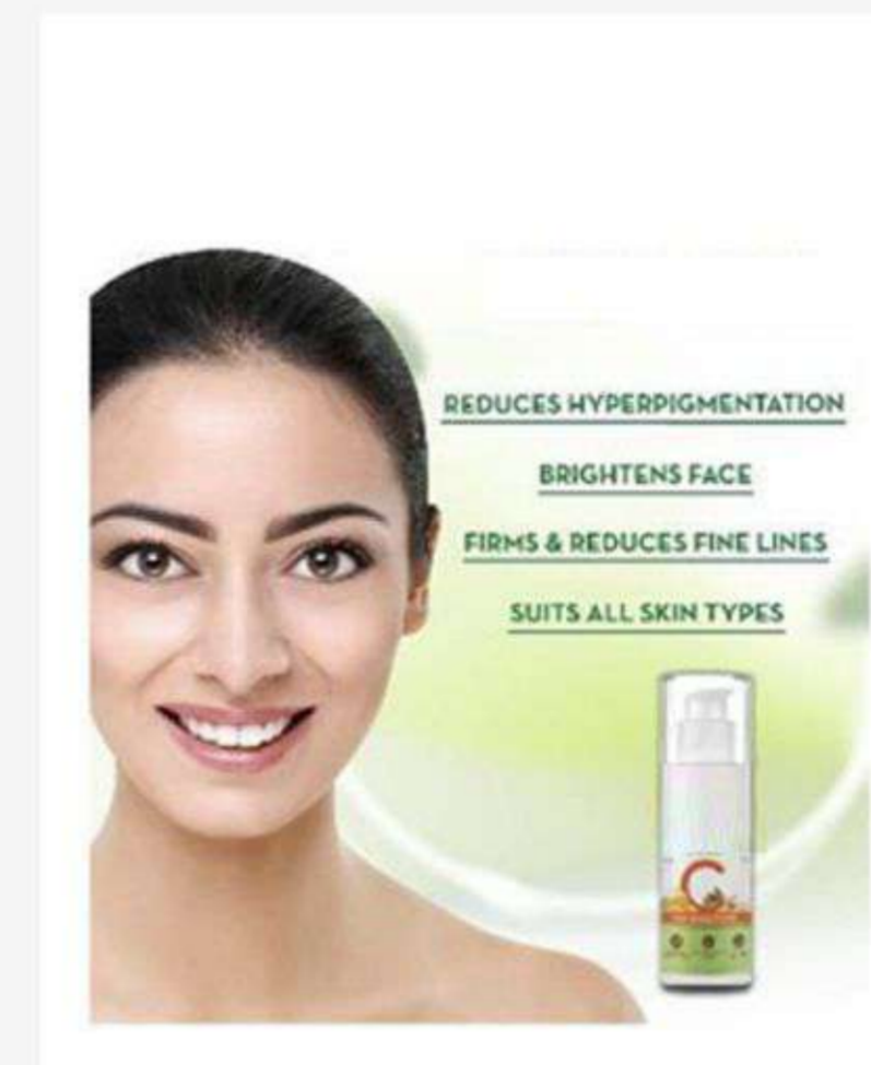
3 . Key Benefits and Details