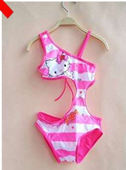
Hangers shots are not allowed