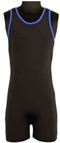
Mannequins are Not allowed