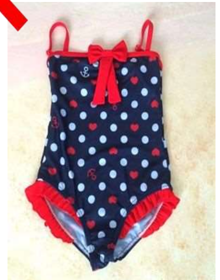
Background color should not be colored