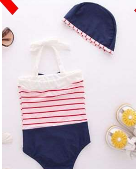
No accessories unless included should be shown