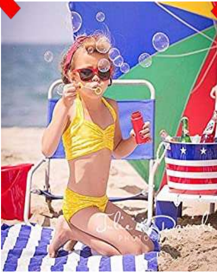
Model shots are not allowed