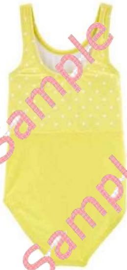
No watermarks should be there on the image