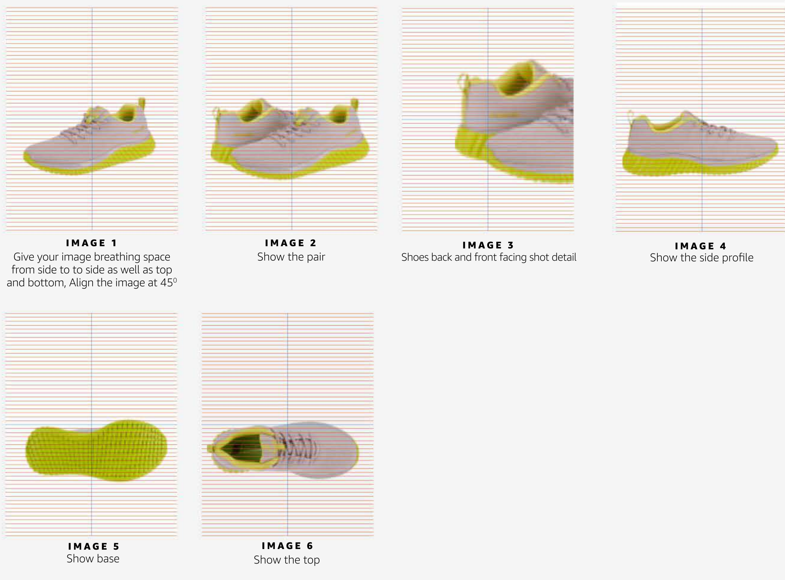
IMAGE 1 Give your image breathing space from side to side as well as top and bottom. Align the image at 45° IMAGE 2 Show the pair IMAGE 3 Shoes back and front facing shot detail IMAGE 4 Show the side profile IMAGE 5 Show base IMAGE 6 Show the top

Use the bars on the image for aligning image