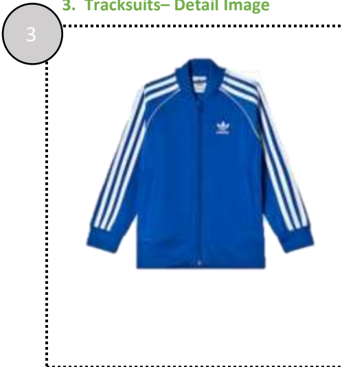
3. Tracksuits– Detail Image