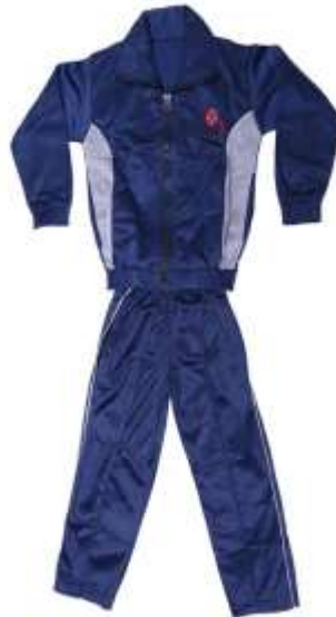
Folding of garment is not allowed