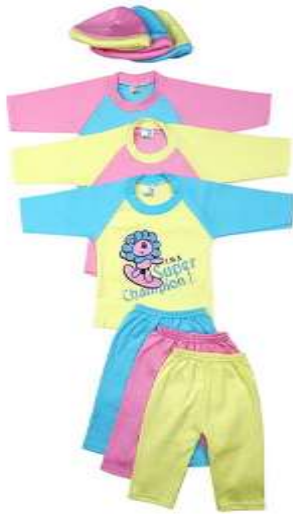
In multi-packs the garments should not overlap