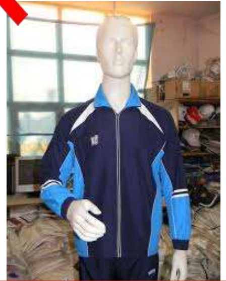
Mannequins are Not allowed