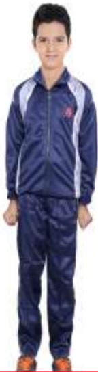
Model shots are not allowed