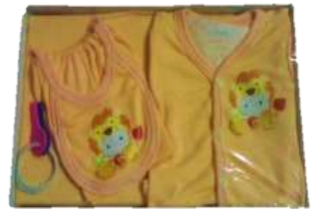
Pack shots are Not allowed