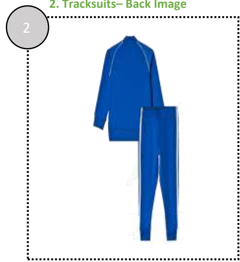
2. Tracksuits– Back Image