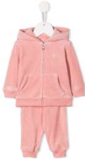
Hangers shots are not allowed