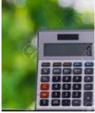
Watermarks or text