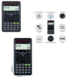
Multi views in MAIN