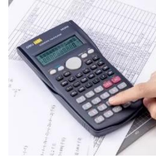
Non-white background in main Image