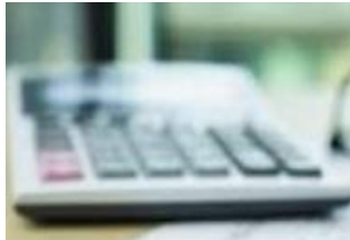
Blurry or pixilated images