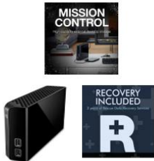
Multi views in MAIN image