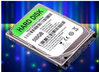
Non-white background in main image