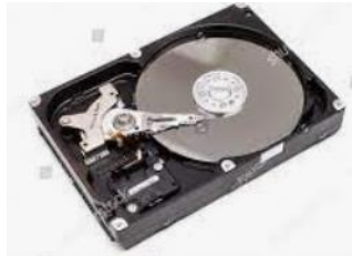
Watermarks or text