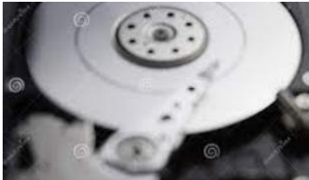
Blurry or pixilated images