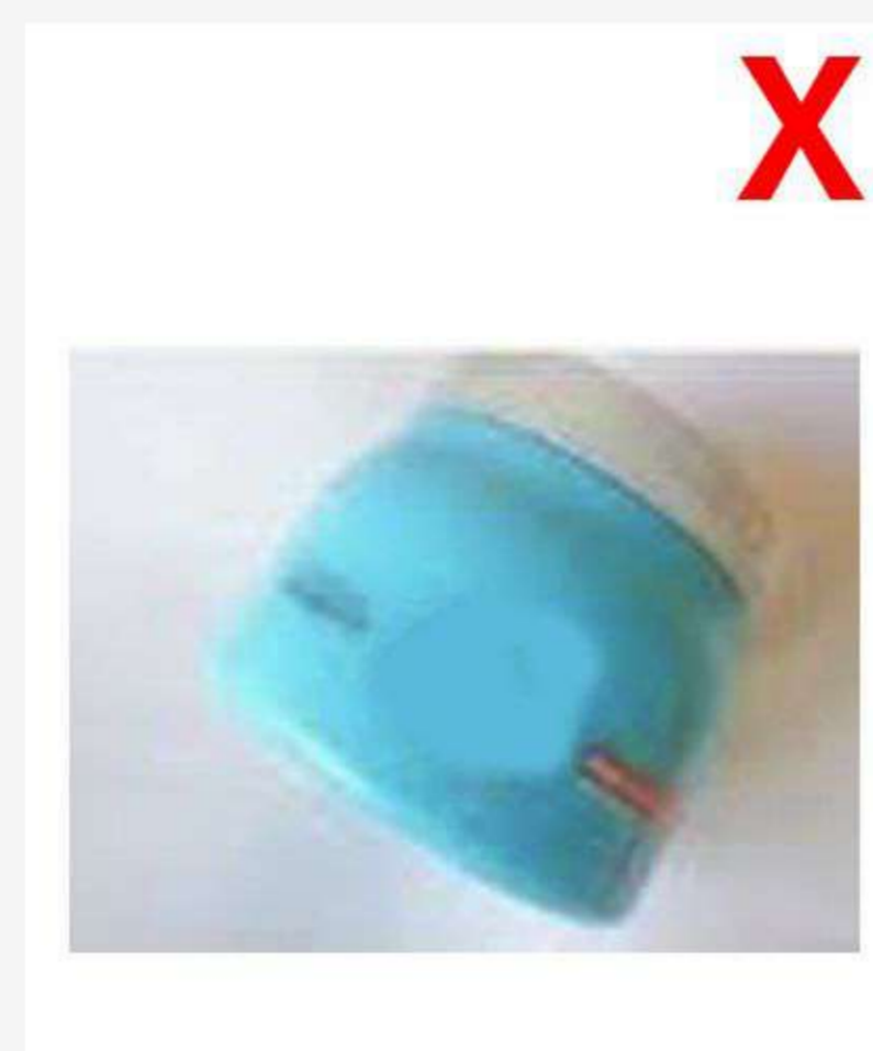
5. Blurry or pixelated images