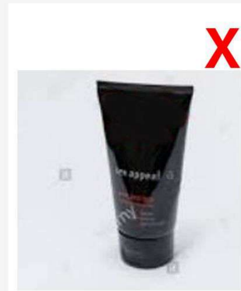
3. Watermarks or text