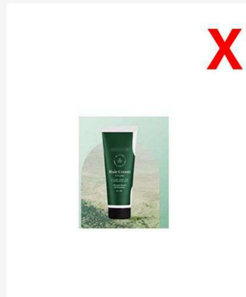
2. Product should occupy 85% of image space