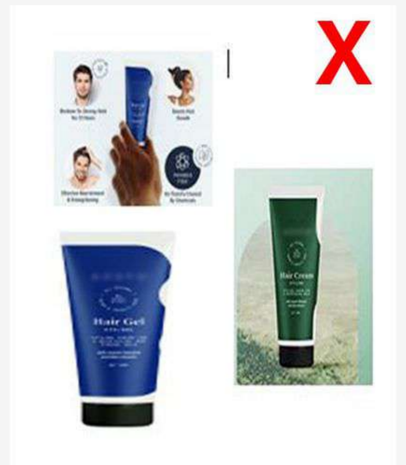
4. Multi views in MAIN image