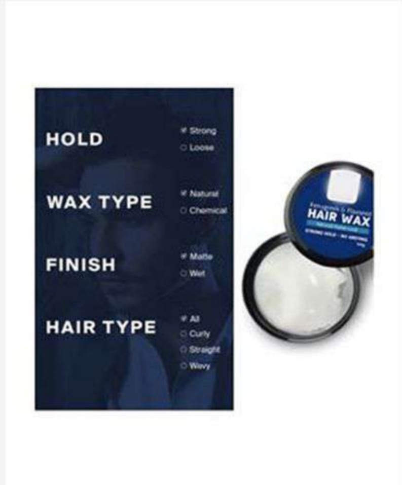
2. Hair Type, Finish