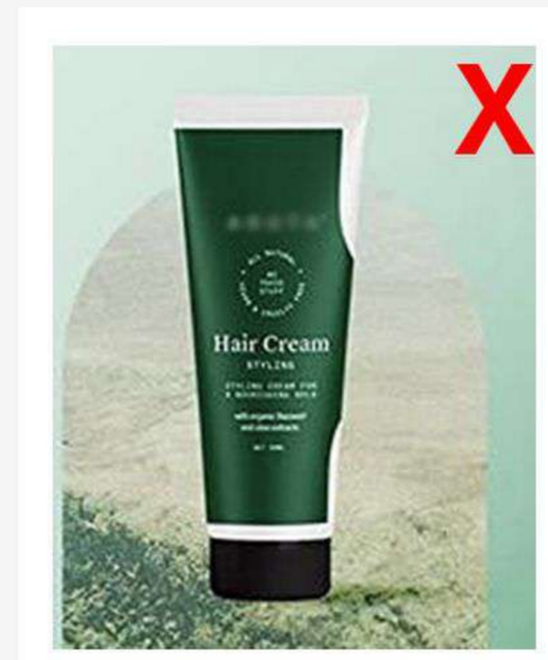
1. Non-white background in main image