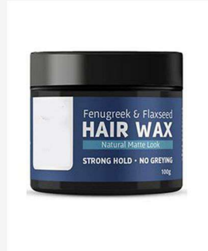
1. Main Image – front shot